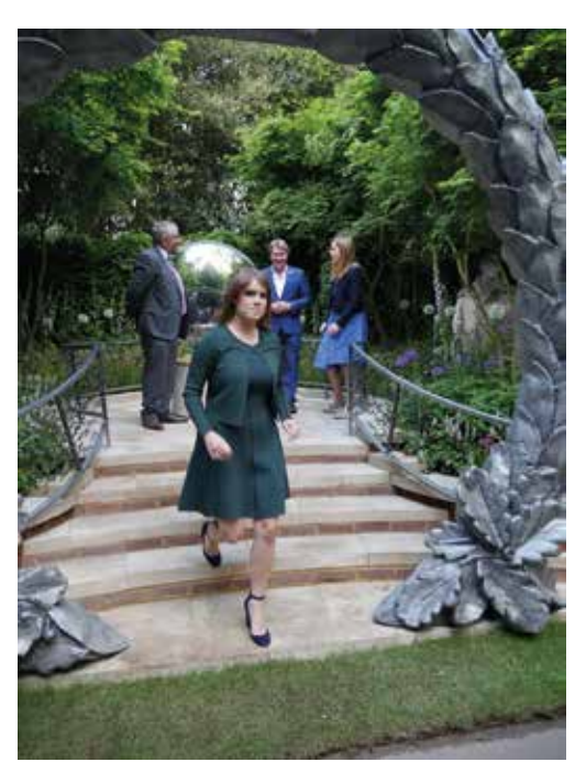
The beautiful entrance arch was created at the CWGC's workshop in 'leper' (Ypres), Belgium, topped with a silver crown referencing the Commission's historical links with empire. Meanwhile, the delicate steelwork - the railings, steel trees and leaves - was handforged by CWGC blacksmiths at the workshop in Beaurains, France.

Many of the garden's features are symbolic of the Commission's past, present and future. The garden uses plant species from sites in the CWGC global estate and elements and materials hand-crafted by the CWGC's own artisans.